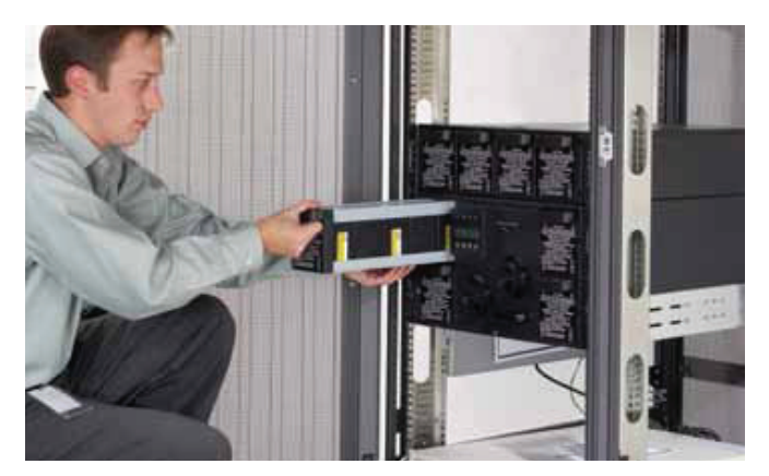
Modular, lightweight design allows for easy installation and service.

Standard internal batteries provide ride-through power until auxiliary power takes over or systems are gracefully shut down. Eaton's unique ABM battery charging technology significantly extends battery service life while optimizing the battery recharge time and giving you up to 50 percent more battery life. For greater runtime, you can add up to four extended battery modules (EBMs). Depending on your load, this could give you hours of runtime.