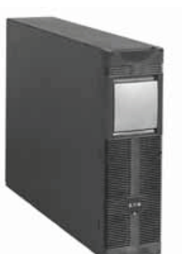
9140 Step-down Transformer option

The 9140 Transformer delivers isolated step-down conversion for 120/208/240V AC outputs and provides maximum flexibility, regardless your power source. Available with 7.5 and 10 kVA options, this unit will convert your incoming power from 208/240V down to 120V effortlessly.