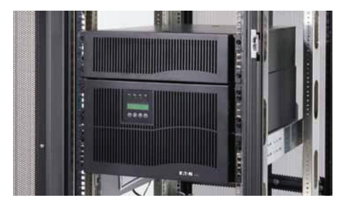
The 9140 and one EBM occupy only 9U of rack space.